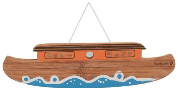
EE33331 Name Plaque Ages: 18m+

This plaque is great for kid's bedroom. It's made from Bamboo and designed in the shape of Noah's Ark. This plaque accomodates up to 6-7 letters. Use our EverEarth adhesive Bamboo letters to spell your child's name and then stick it to the plaque.